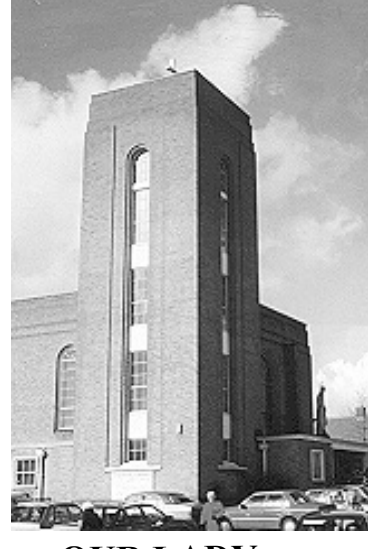
OUR LADY, QUEEN OF APOSTLES